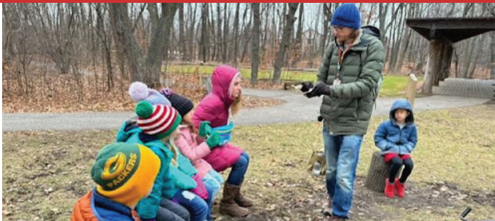
Field trip to Schlitz Audubon Nature Center.