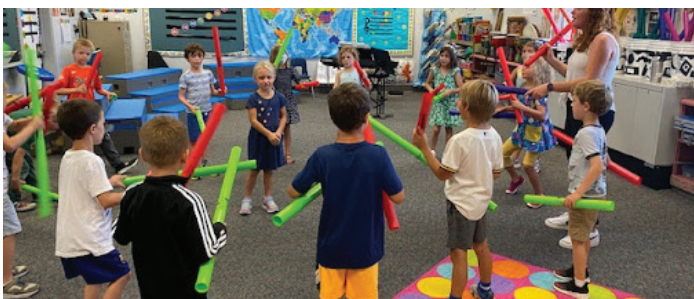
First grade students learn music through movement.