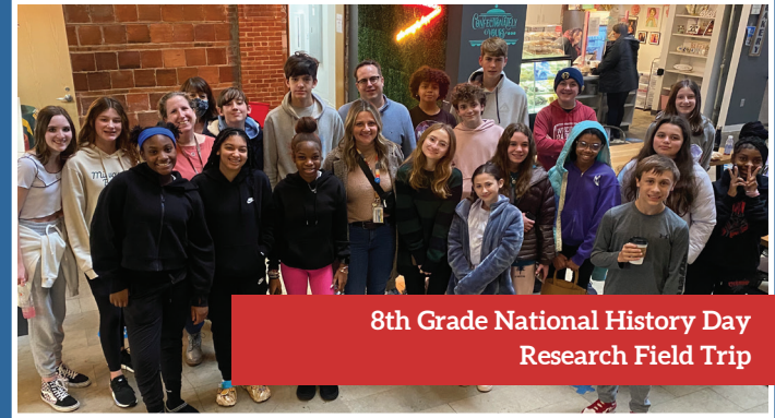
8th Grade National History Day Research Field Trip

Late fall and early winter brought exciting opportunities for Bayside students, including a special visit by best-selling author Jason Reynolds, Margaret A. Edwards Award recipient, at our all-school assembly on November 3. Following his Q&A, each student received a copy of one of Jason Reynolds' award-winning books.