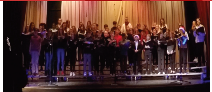
Bayside students performing at the winter concert.