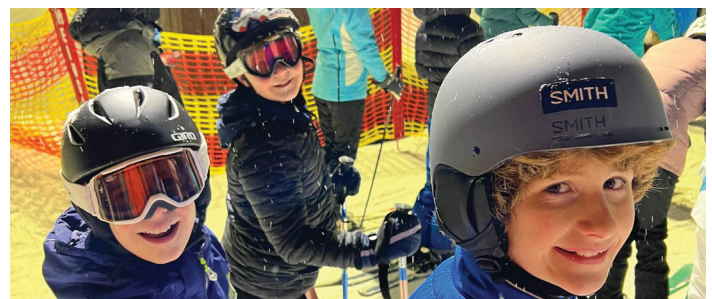
Bayside students enjoying a snowy ski club evening.